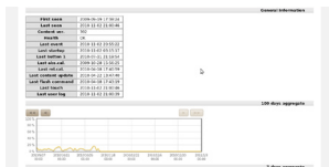
View logs, statistics, health status from a webpage Intelligent watchdog and e-mail notification